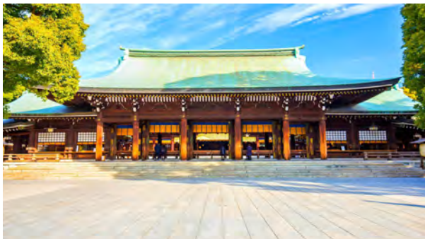
Meiji Jingu Shrine

Tokyo Pick up at Designated Hotel (09:00am Public transportation:metro,bus or walking. Taxi fare is not included, if you prefer hailing a taxi. ) by Private Tour Guide