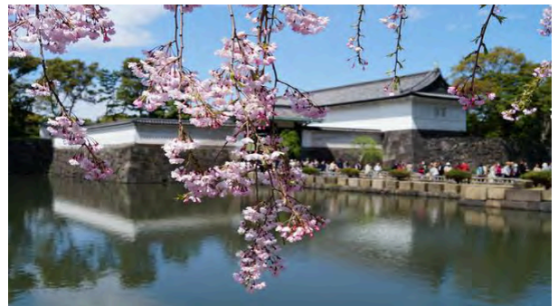
Imperial Palace East Gardens

Meiji Shrine and the adjacent Yoyogi Park make up a large forested area within the densely built-up city.